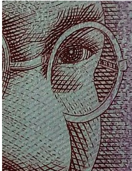
Microscopic view of the 2000 Indian currency note showing micro printing of letters 'RBI'

The 2000 banknotes has multiple security features, listed below: [1]